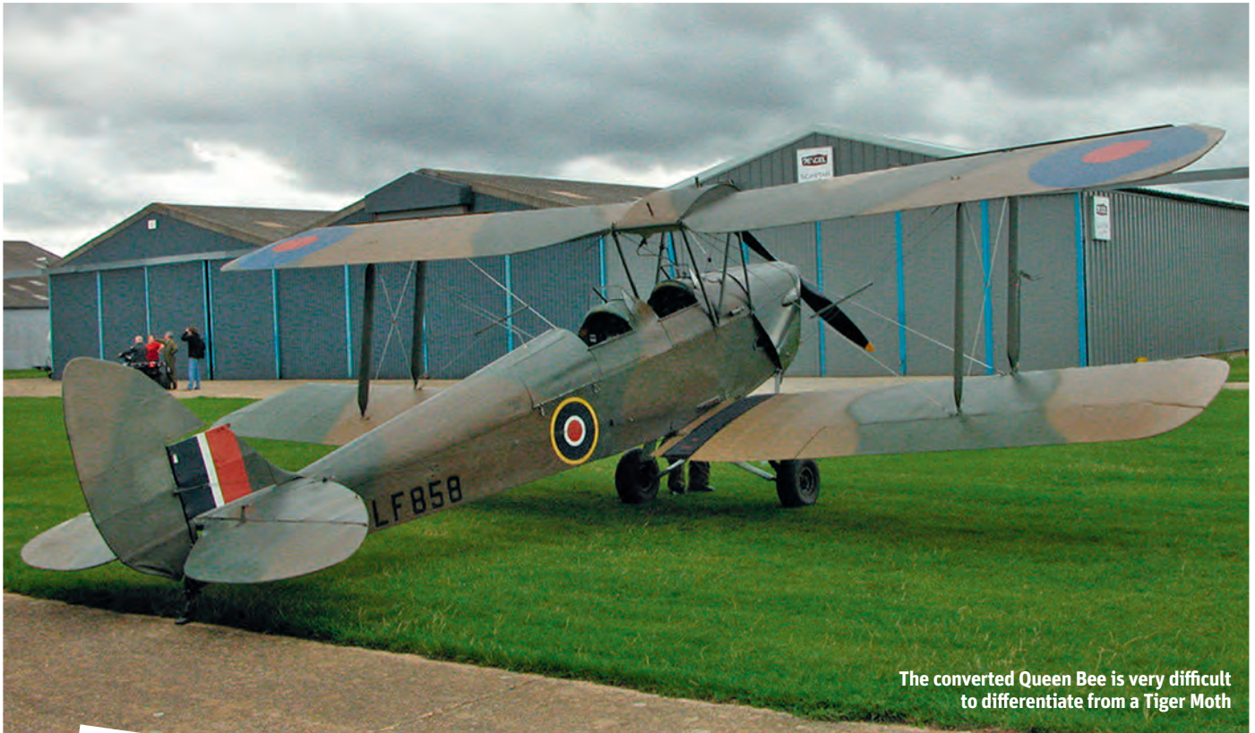
The converted Queen Bee is very difficult to differentiate from a Tiger Moth