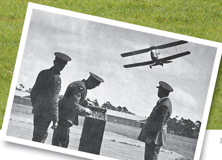
Main picture: the sole flying Queen Bee operated today as a piloted aircraft but shown (left) in its wartime guise being flown remotely by RAF operatives