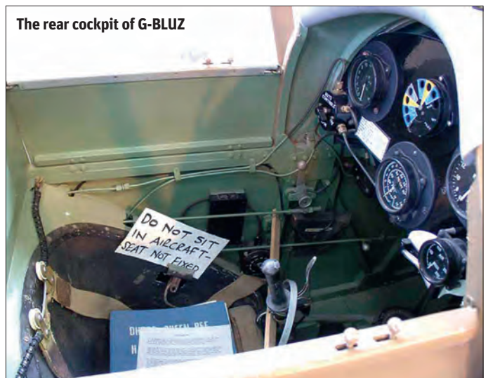
The rear cockpit of G-BLUZ