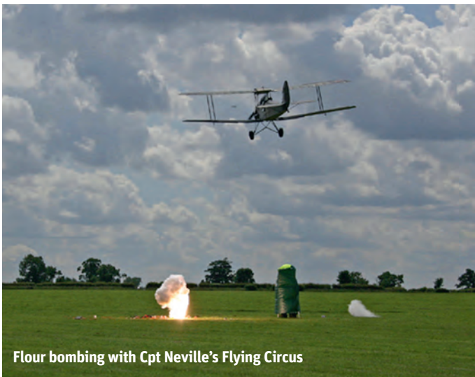
Flour bombing with Cpt Neville's Flying Circus