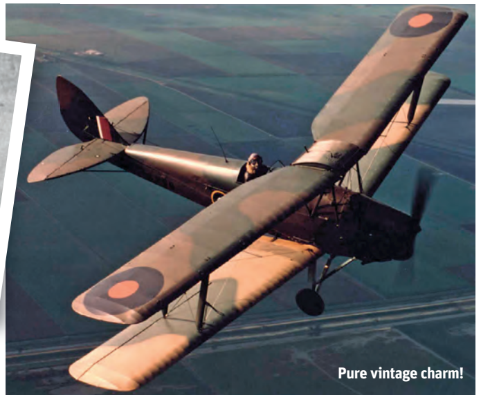
Pure vintage charm!