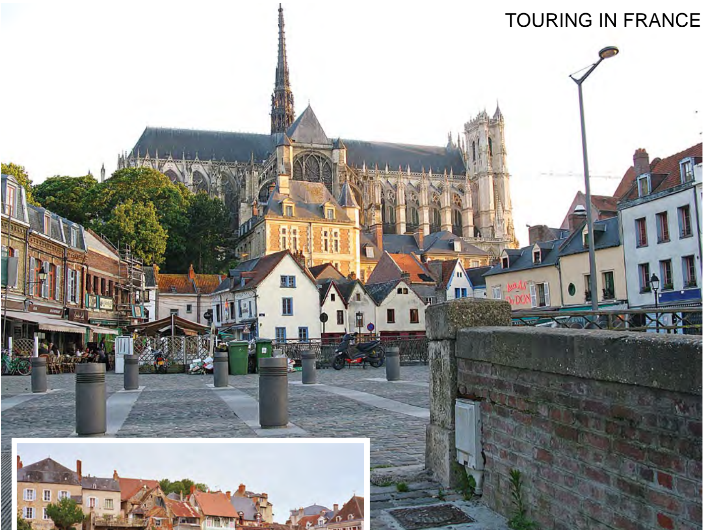
(Above) The grand cathedral dominates the skyline of Amiens