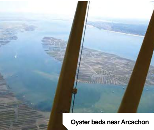
Oyster beds near Arcachon