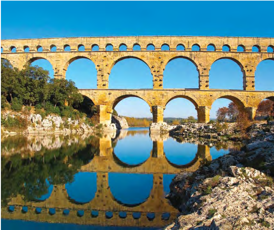
Pont du Gard