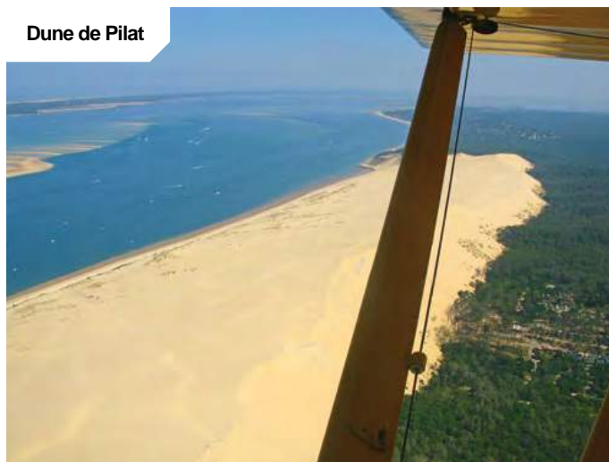
Dune de Pilat